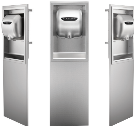
(XLERATOR Hand Dryer not included)

PART #40550 - STANDARD PART #40551 - ADA HEIGHT