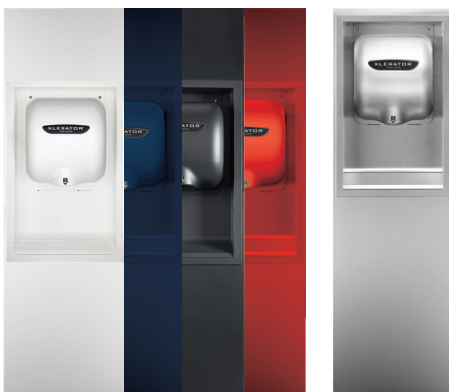
(Dryer Sold Separately)

NATIONAL INSTALLATION SERVICES AVAILABLE • CALL FOR DETAILS 800-255-9235